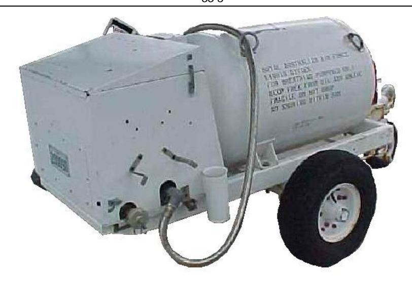
Figure 55–3: Oxygen Trailer