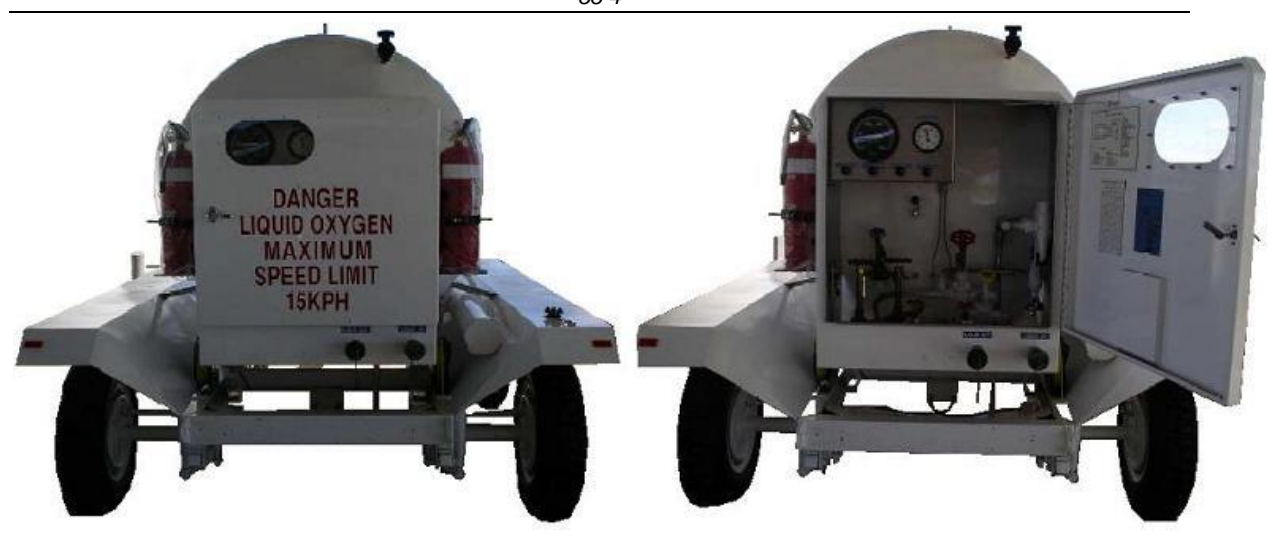
Figure 55–5: Oxygen Trailer 500 Gallon Control Cabin