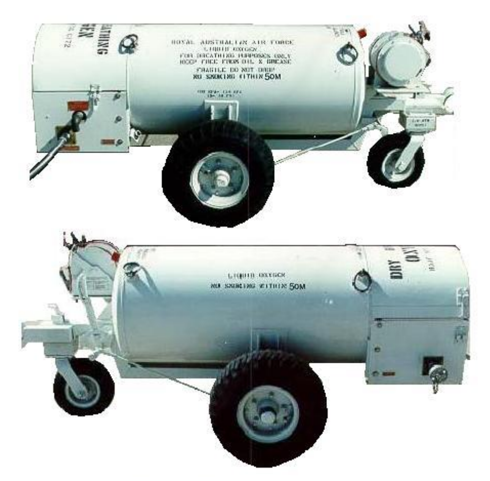
Figure 55–2: Oxygen Trailer 50 Gallon 3 Wheel Trolley Side