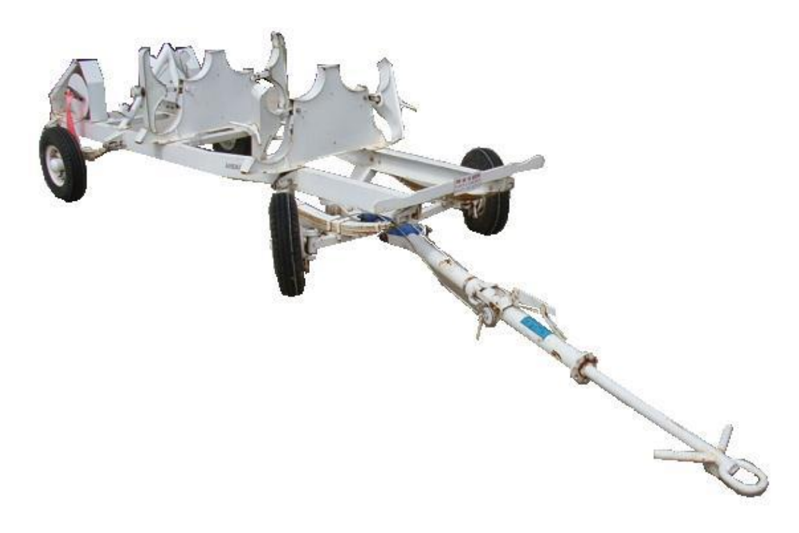
Figure 55-6: Oxygen Trailer 4 Bottle De-tanked

EXTREME CAUTION GASSEOUS COMPONENTS All Oxygen Trailers are to be de-rigged of bottles and the regulator removed prior to any cleaning. The de-rigging and the removal of the regulator is to be conducted by or under the supervision of a qualified technician