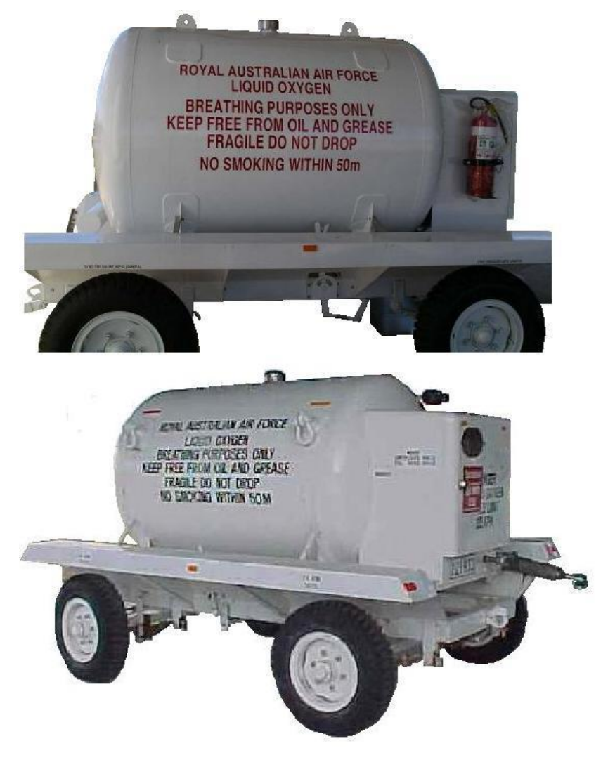
Figure 55-4: Oxygen Trailer 500 Gallon