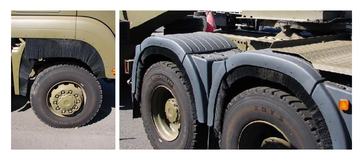
Figure 91-6: Prime Mover Front and Rear Wheel Anti-splash Fittings