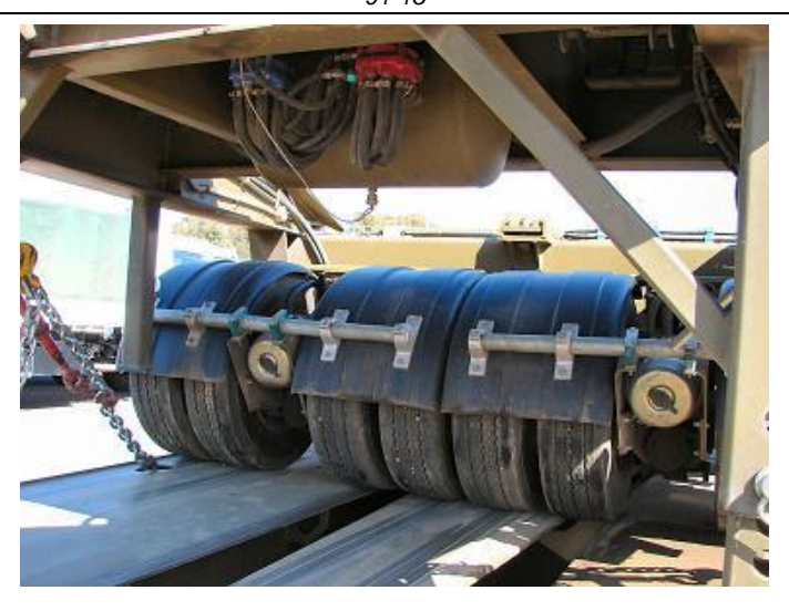
Figure 91–24: Expanding Dolly Front of Wheels