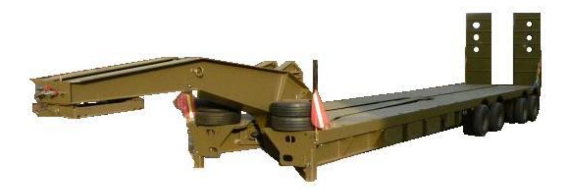
Figure 91-27: Drake 4x8 Expanding Deck, Swing-wing Trailer

91.14 The cleaning instructions for the Drake Trailer, as illustrated in Figures 91-27 to 91-32, include the points detailed in Table 91-10.