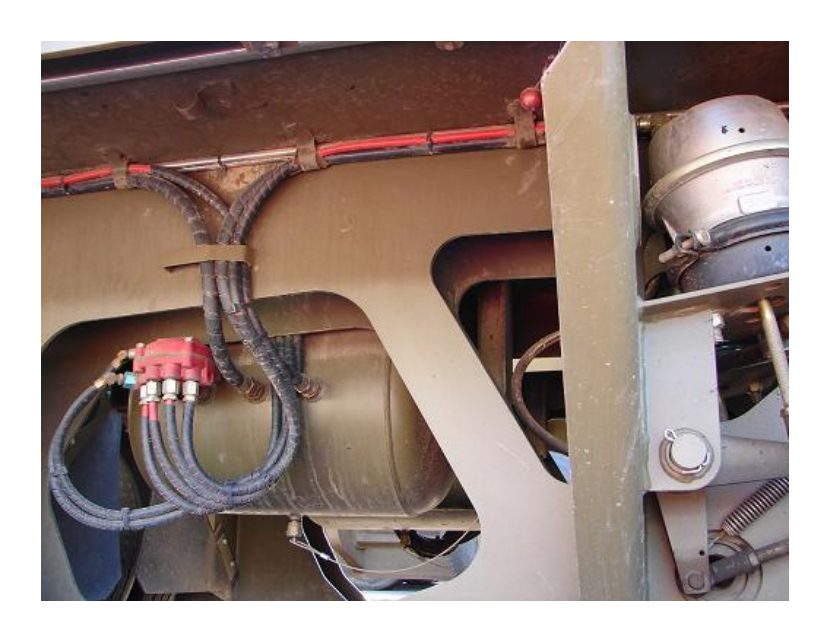
Figure 91-35: Drake Swing-wing Trailer's Hydraulics