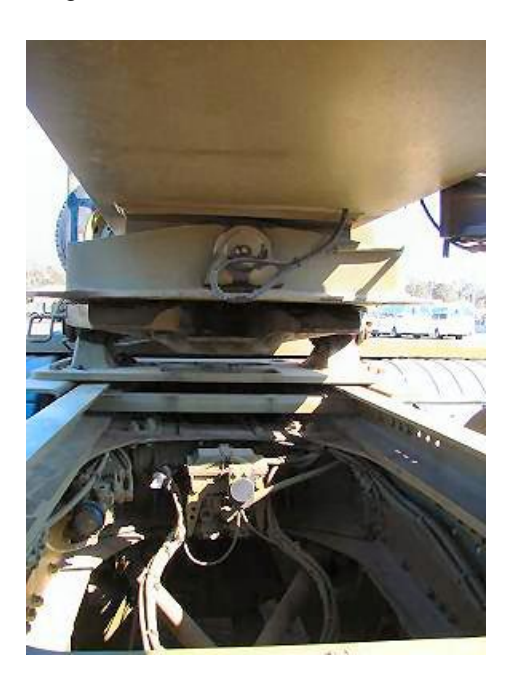
Figure 91–9: Prime Mover Turntable and Hydraulics