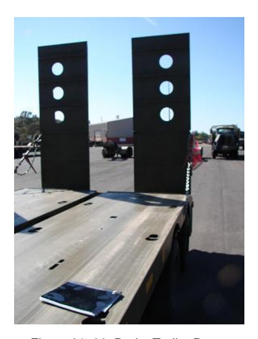
Figure 91-30: Drake Trailer Ramp