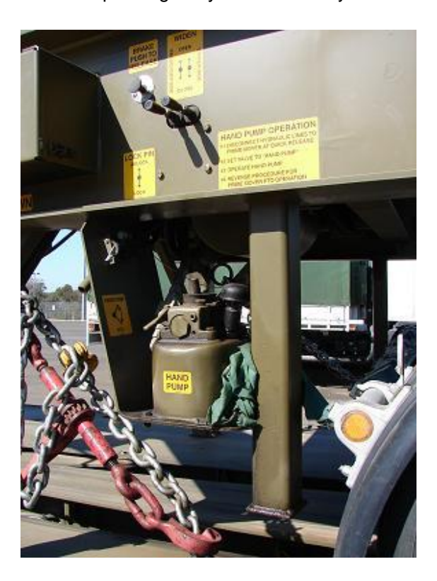
Figure 91–26: Expanding Dolly Converter's Hydraulics