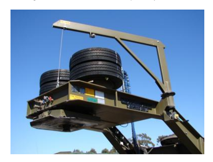
Figure 91–37: Expanding Dolly Converter Spare Tyre Mounts