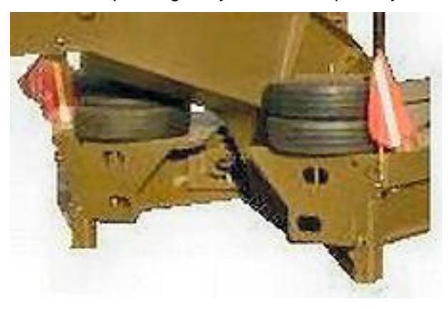
Figure 91–38: Drake Trailer Spare Tyre Mounts