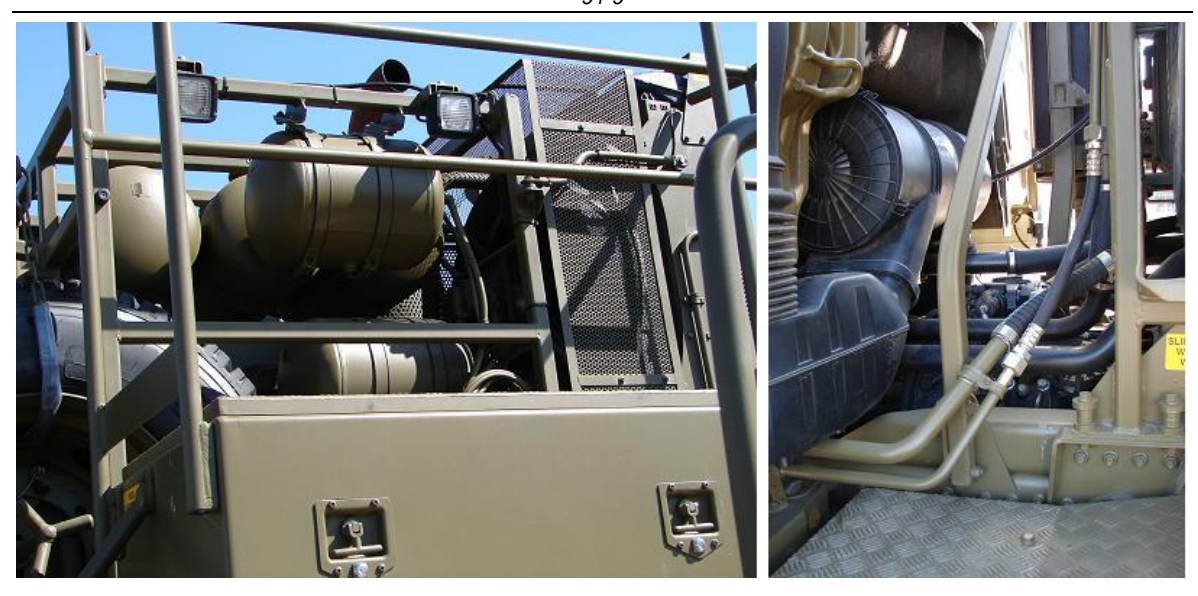
Figure 91-13: Prime Mover Hydraulic and Air Lines