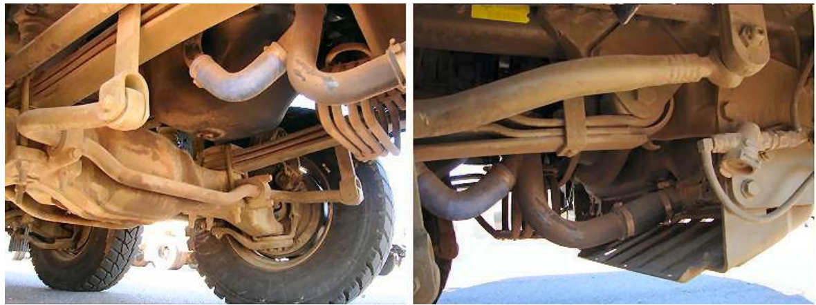
Figure 91-15: Prime Mover's Front Wheels Suspension and rear of Bumper/Scrape Guard

91.9 The cleaning instructions for the prime mover's suspension, as illustrated in Figures 91-15 to 91-17, include the points detailed in Table 91-5.