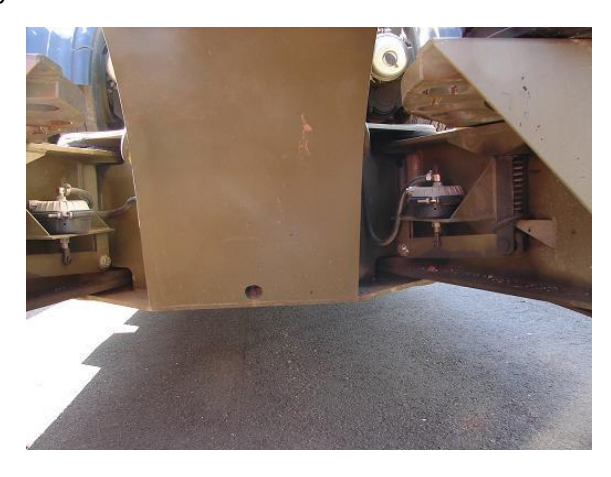
Figure 91–29: Drake Trailer Extension Arm Underside