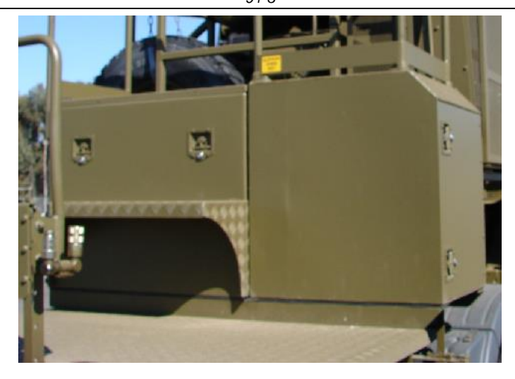
Figure 91–4: Prime Mover Main Stowage Bins