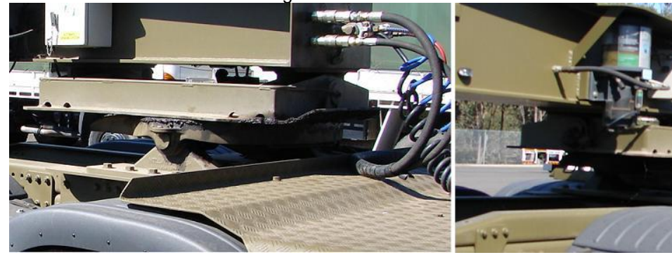
Figure 91–8: Prime Mover Turntable