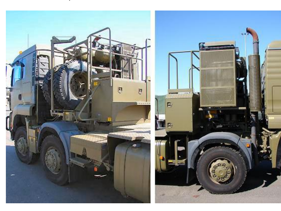
Figure 91–12: Prime Mover Hydraulic and Air Lines

91.8 The cleaning instructions for the prime mover's hydraulics, as illustrated in Figures 91-12 to 91-14, include the points detailed in Table 91-4.