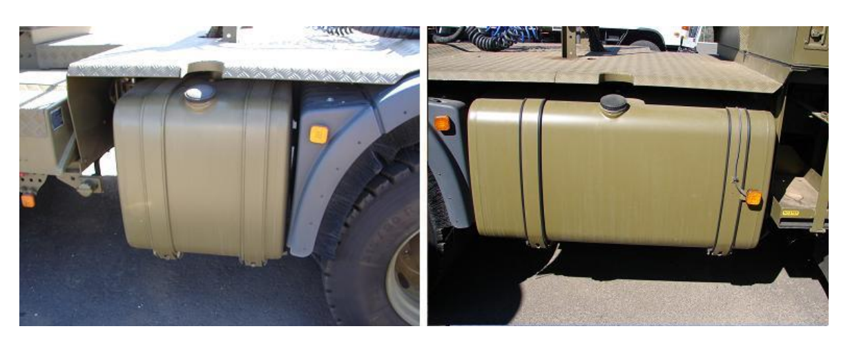
Figure 91–3: Prime Mover Fuel Tanks

91.5 The cleaning instructions for the prime mover's external areas, as illustrated in Figures 91-2 to 91-11, include the points detailed in Table 91-1.