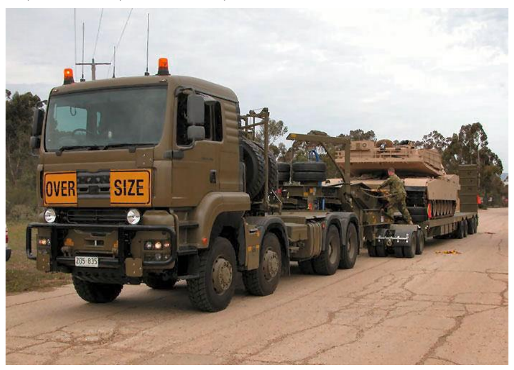
Figure 91-1: Heavy Tank Transporter