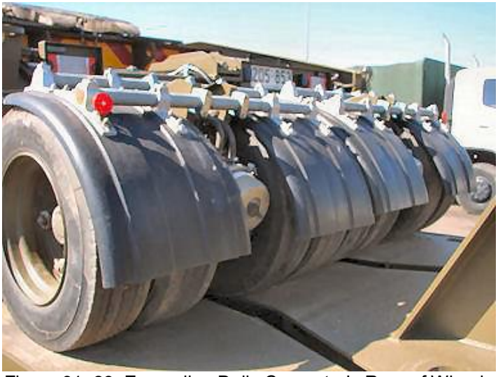
Figure 91-23: Expanding Dolly Converter's Rear of Wheels

91.12 The cleaning instructions for the Expanding Dolly Converter's suspension, as illustrated in Figures 91-23 and 91-24, include the points detailed in Table 91-8.