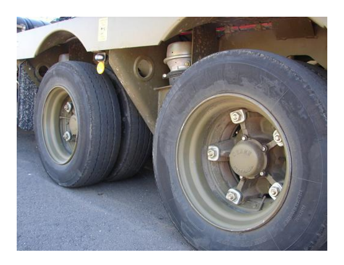
Figure 91-33: Drake Swing-wing Trailer's Suspension

91.16 The cleaning instructions for the Drake Swing-wing Trailer's suspension, as illustrated in Figure 91-33, include the points detailed in Table 91-12.