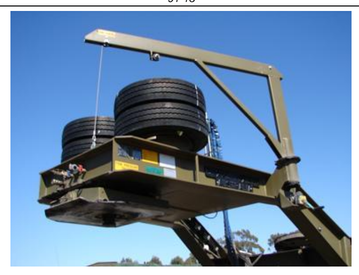
Figure 91–21: Expanding Dolly Converter Spare Tyre Mounts