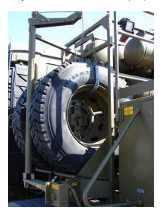
Figure 91–11: Prime Mover Spare Tyre Mount and Winch