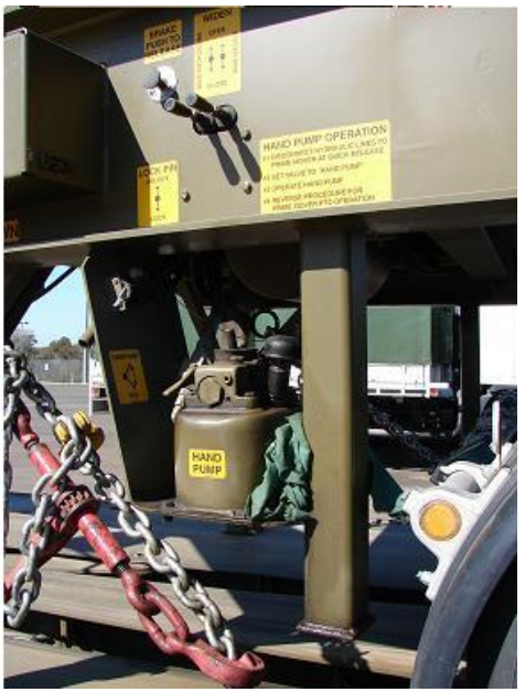
Figure 91–22: Expanding Dolly Converter Support Stand Left Side (Left) and Right Side (Right)