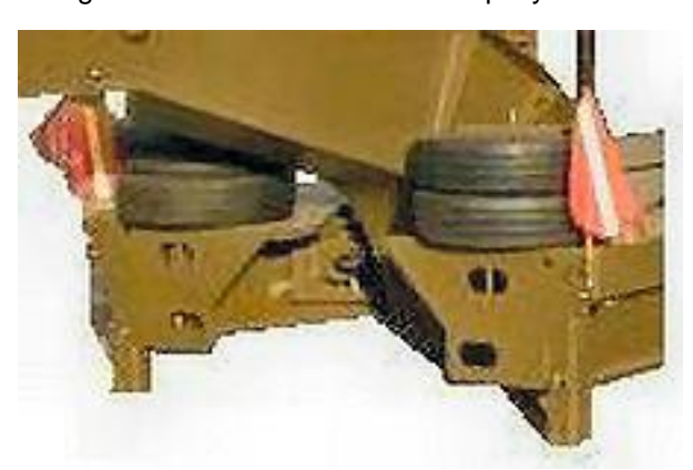
Figure 91-32: Drake Trailer Spare Tyre Mounts