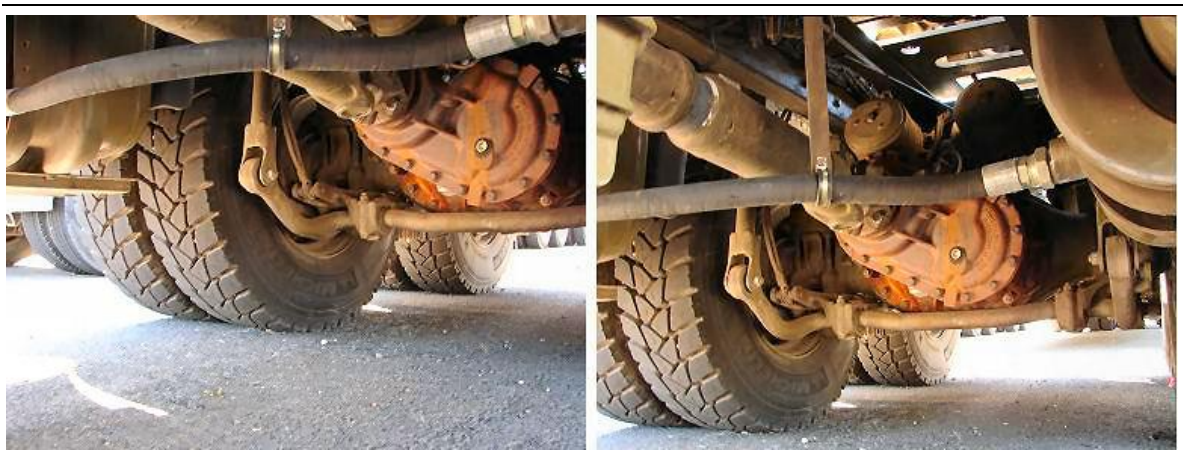
Figure 91-17: Prime Mover's Rear Wheels Suspension and Differential