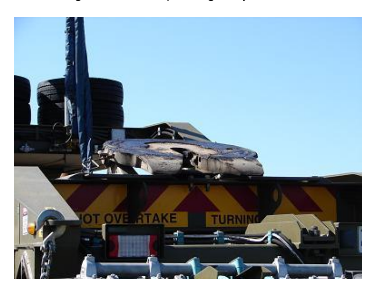
Figure 91–19: Expanding Dolly Converter Turntable