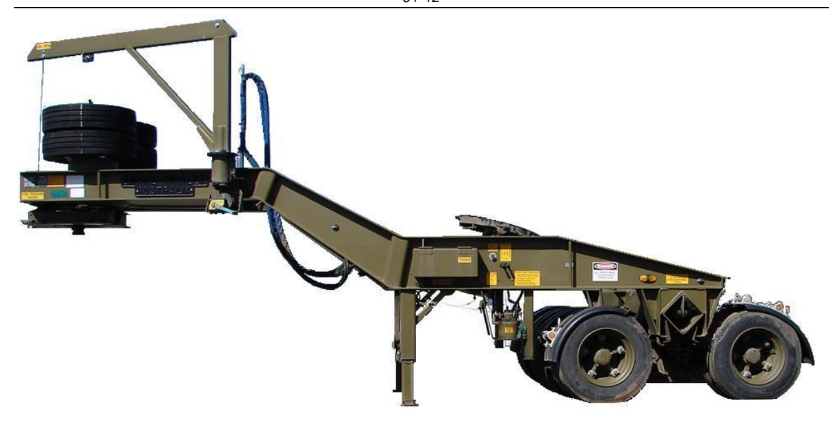
Figure 91–18: Expanding Dolly Converter