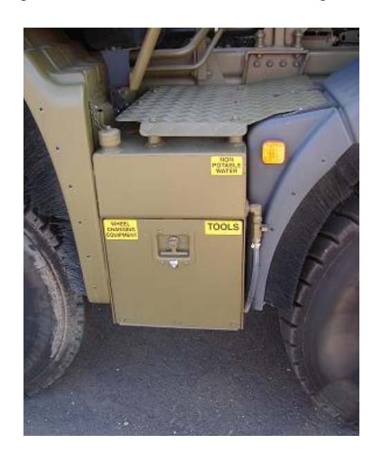
Figure 91–5: Prime Mover Water and Wheel Change Tool Box