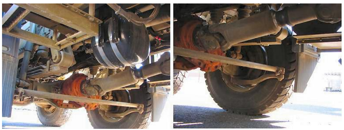
Figure 91-16: Prime Mover's Front Wheels Suspension and Tail-shaft