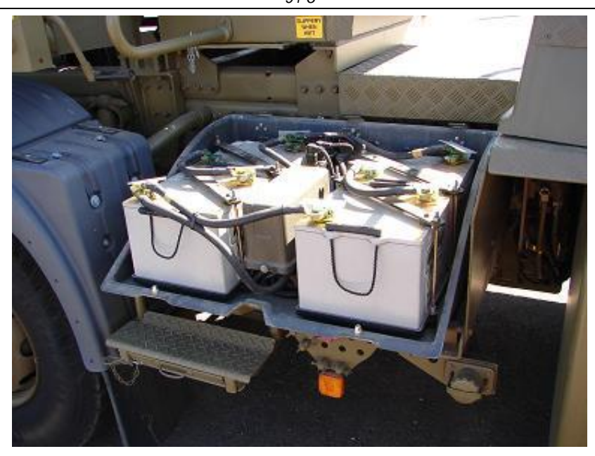
Figure 91–10: Prime Mover Battery Bay