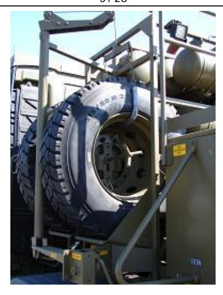
Figure 91–36: Prime Mover Spare Tyre Mount