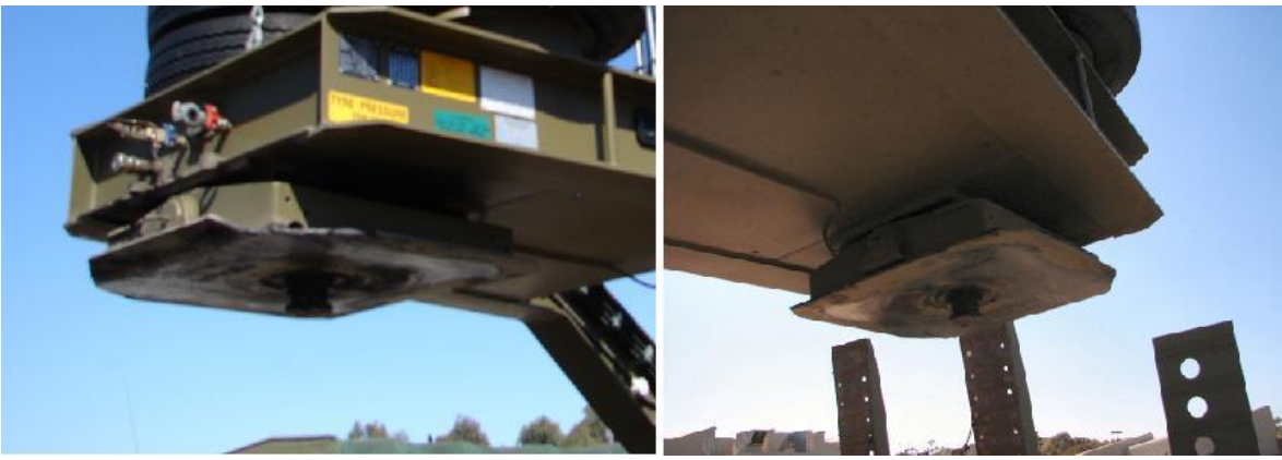
Figure 91–20: Expanding Dolly Converter Connecting Plate