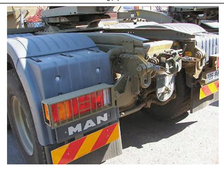
Figure 91–7: Prime Mover Rear View